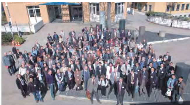
Figure 1. Participants of the ICDP conference.

The formation of impact craters has changed the Earth dramatically through geological time and has been a key factor in the development of life on our planet. It is beyond